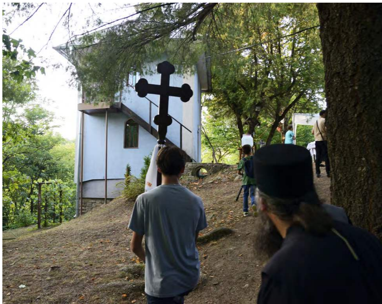
10 - 18 Uličské Krivé, 2022