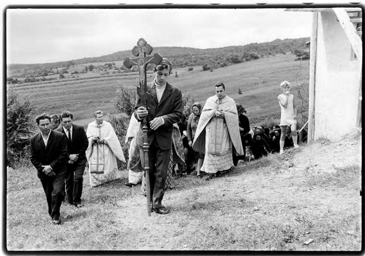
1 - 9 Uličské Krivé, 1871 - 72